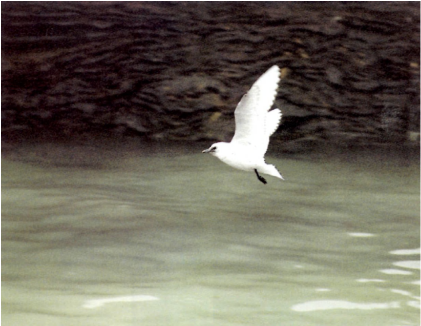
▲▼ 104 & 105. Second in THE CARL ZEISS AWARD: first-winter Ivory Gull Pagophila eburnea , Kinnairds Head, Northeast Scotland, 24th/25th October 1997