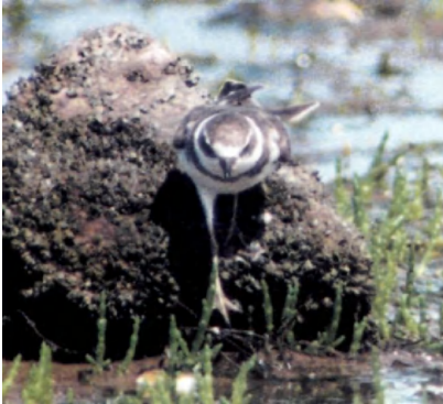
▲◀▼ 106-109. Third in THE CARL ZEISS AWARD: first-summer Semipalmated Plover Charadrius semipalmatus (top, with Great Ringed Plover C. hiaticula ), Devon, June 1997